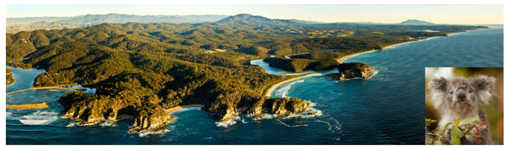
From the Bega River mouth to Mumbulla and Gulaga Mountains