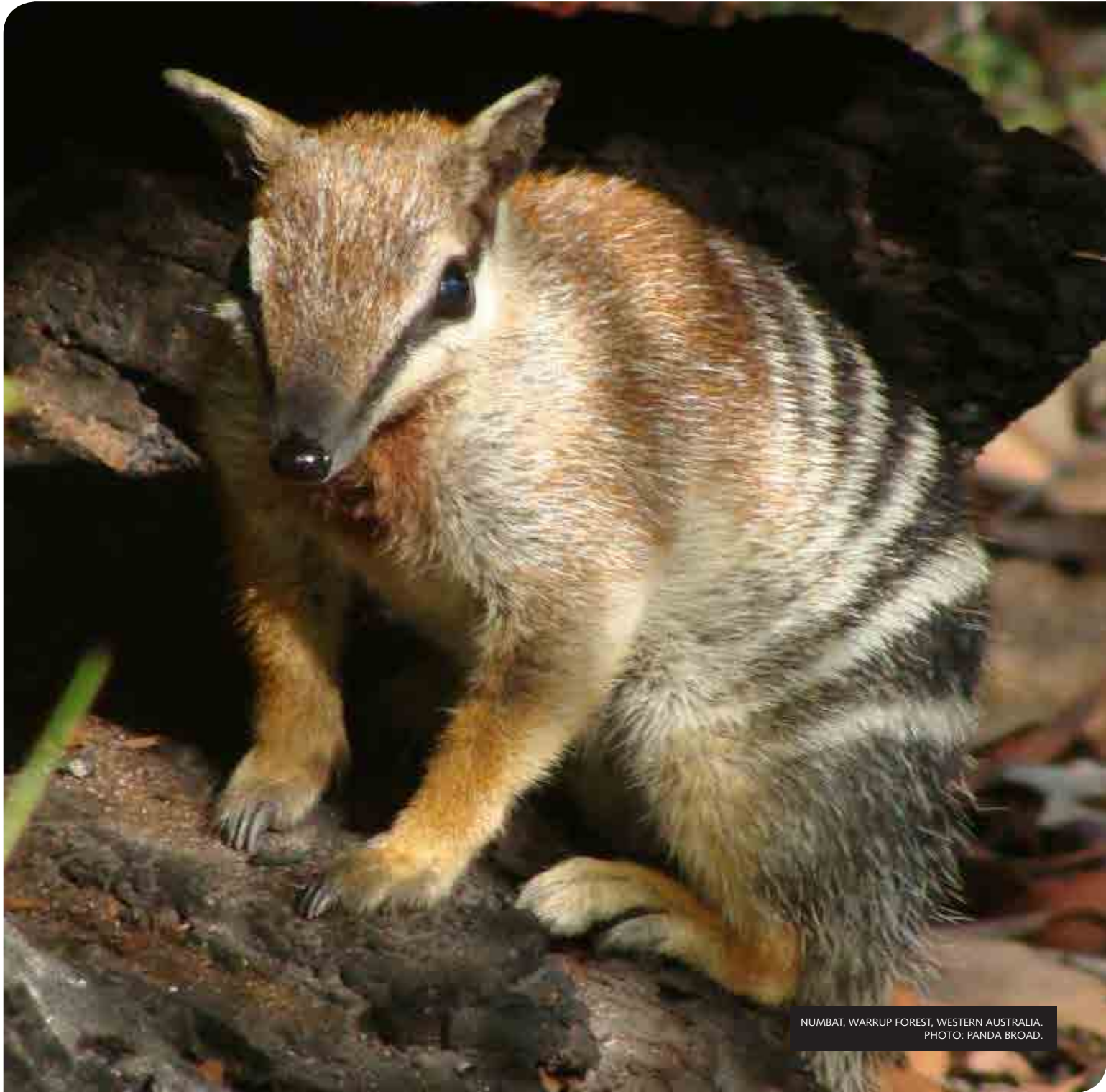
NUMBAT, WARRUP FOREST, WESTERN AUSTRALIA.

Significant procedural barriers and costs risks mean third party enforcement can only occur in limited circumstances, and be undertaken by groups with significant involvement and commitment to an issue, as well as access to significant resources. This means in circumstances where government is failing to enforce compliance with forestry laws, it is difficult for the community to pick up the slack. Nevertheless, there have been several instances when communities have taken enforcement proceedings and in doing so, have played an essential role in drawing attention to the failures of forestry agencies to comply with environment protection laws.