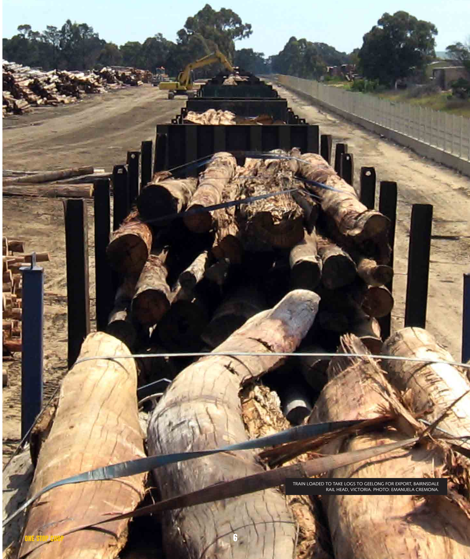
TRAIN LOADED TO TAKE LOGS TO GEELONG FOR EXPORT, BAIRNSDALE RAIL HEAD, VICTORIA.