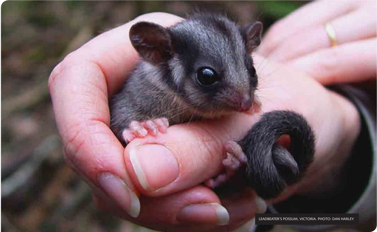
LEADBEATER'S POSSUM, VICTORIA.

are done in accordance with the approved policy, plan or program, approval of individual actions under Part 9 of the EPBC Act is not required.