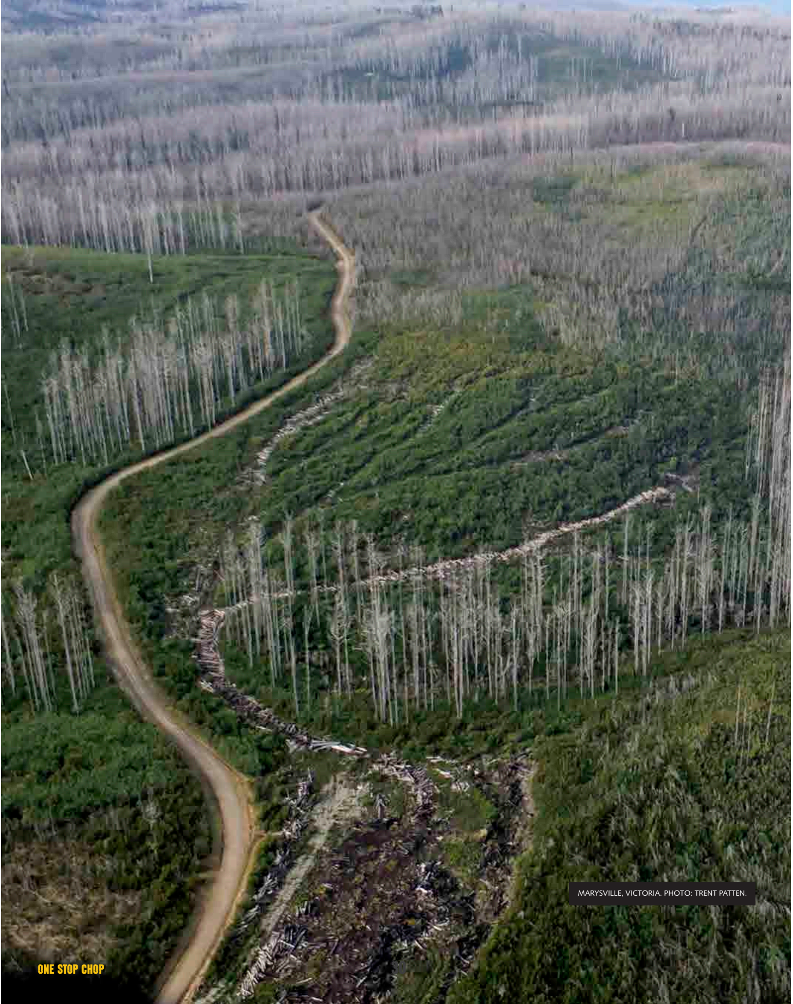
MARYSVILLE, VICTORIA.