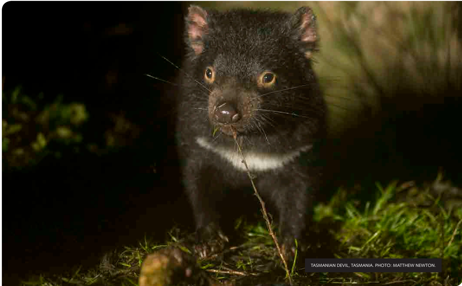
TASMANIAN DEVIL, TASMANIA.

senior zoologists in accordance with the Adviser are negotiable, if Forestry Tasmania objects.” (at [289]). He further noted (at [282]):